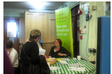
Patient and Client Council - one of the many stands available on the day